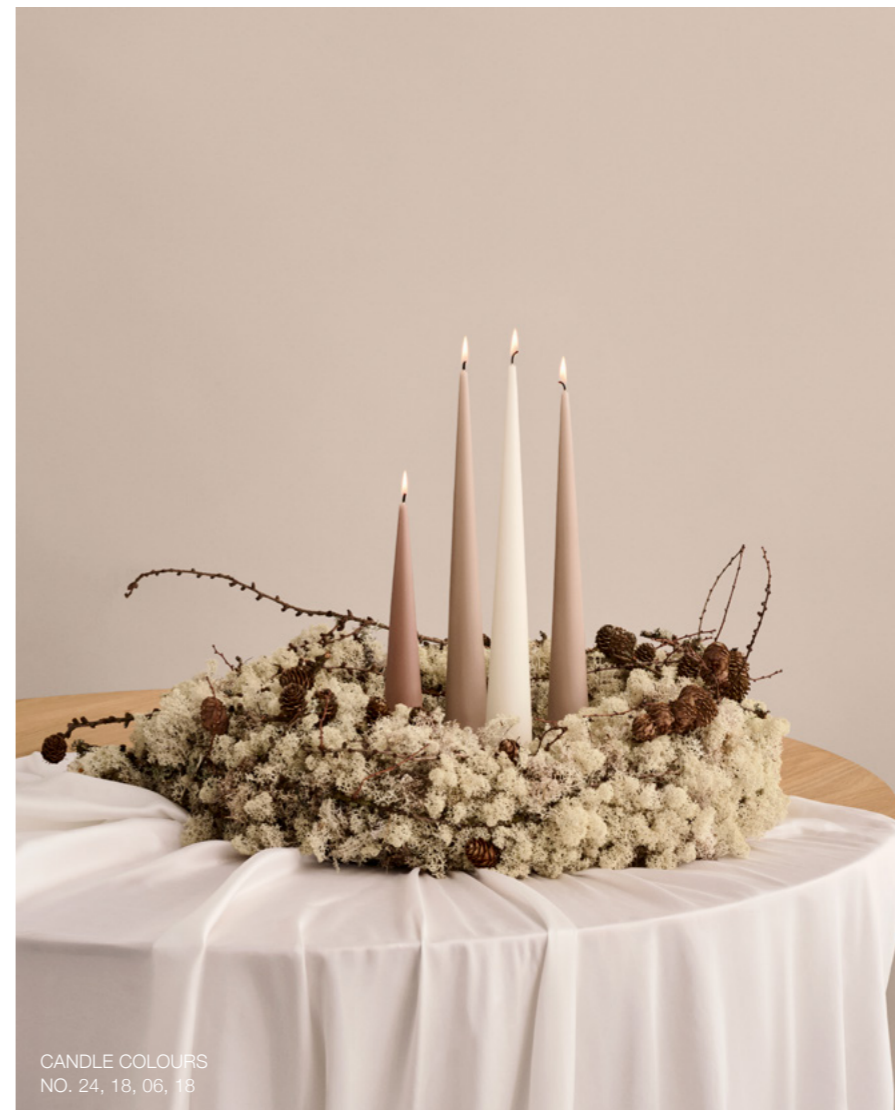
CANDLE COLOURS NO. 24, 18, 06, 18