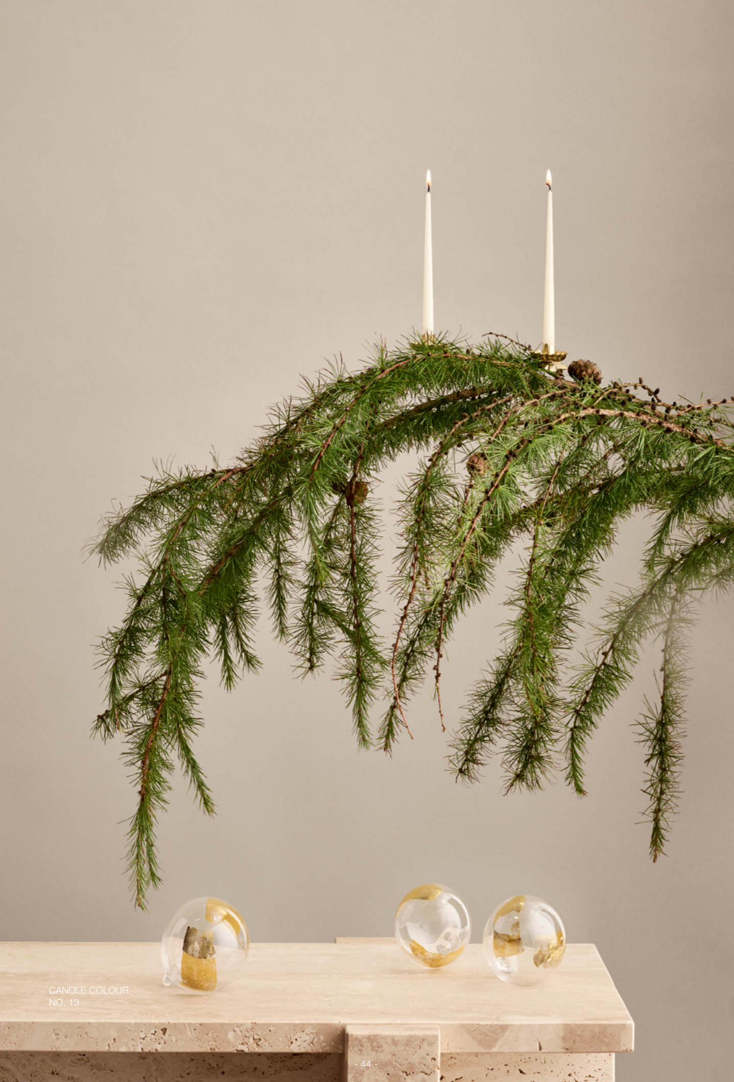
CANDLE COLOUR NO. 13