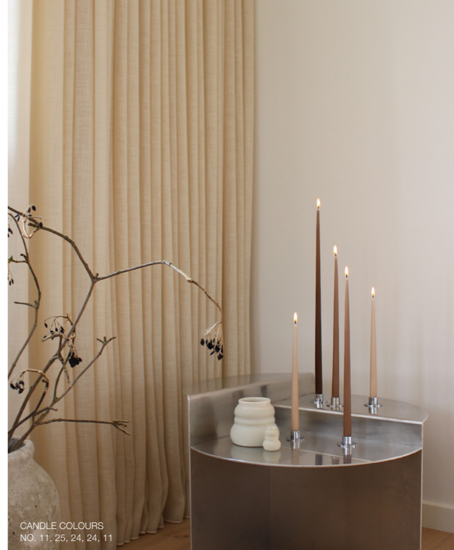
CANDLE COLOURS NO. 11, 25, 24, 24, 11