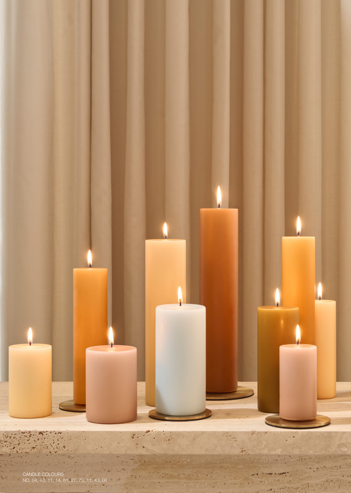
CANDLE COLOURS NO. 04, 43, 11, 14, 81, 27, 73, 11, 43, 04