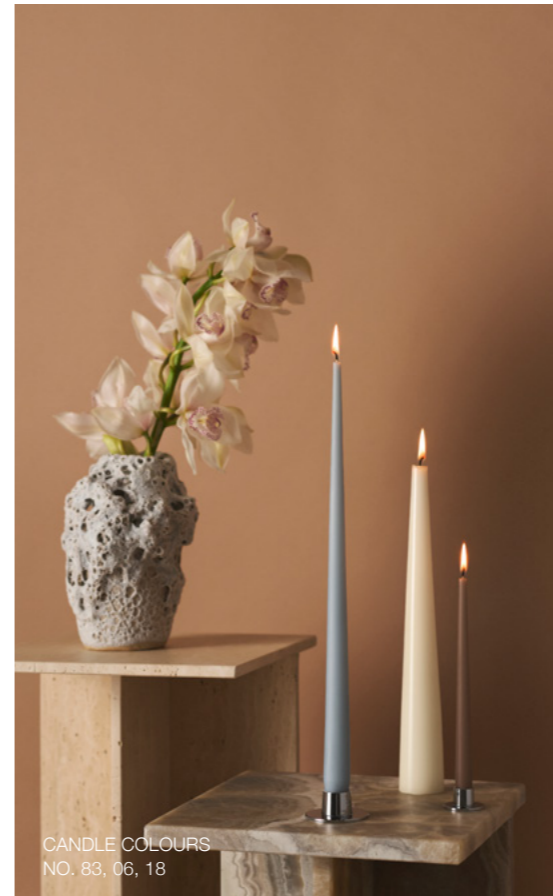
CANDLE COLOURS NO. 83, 06, 18