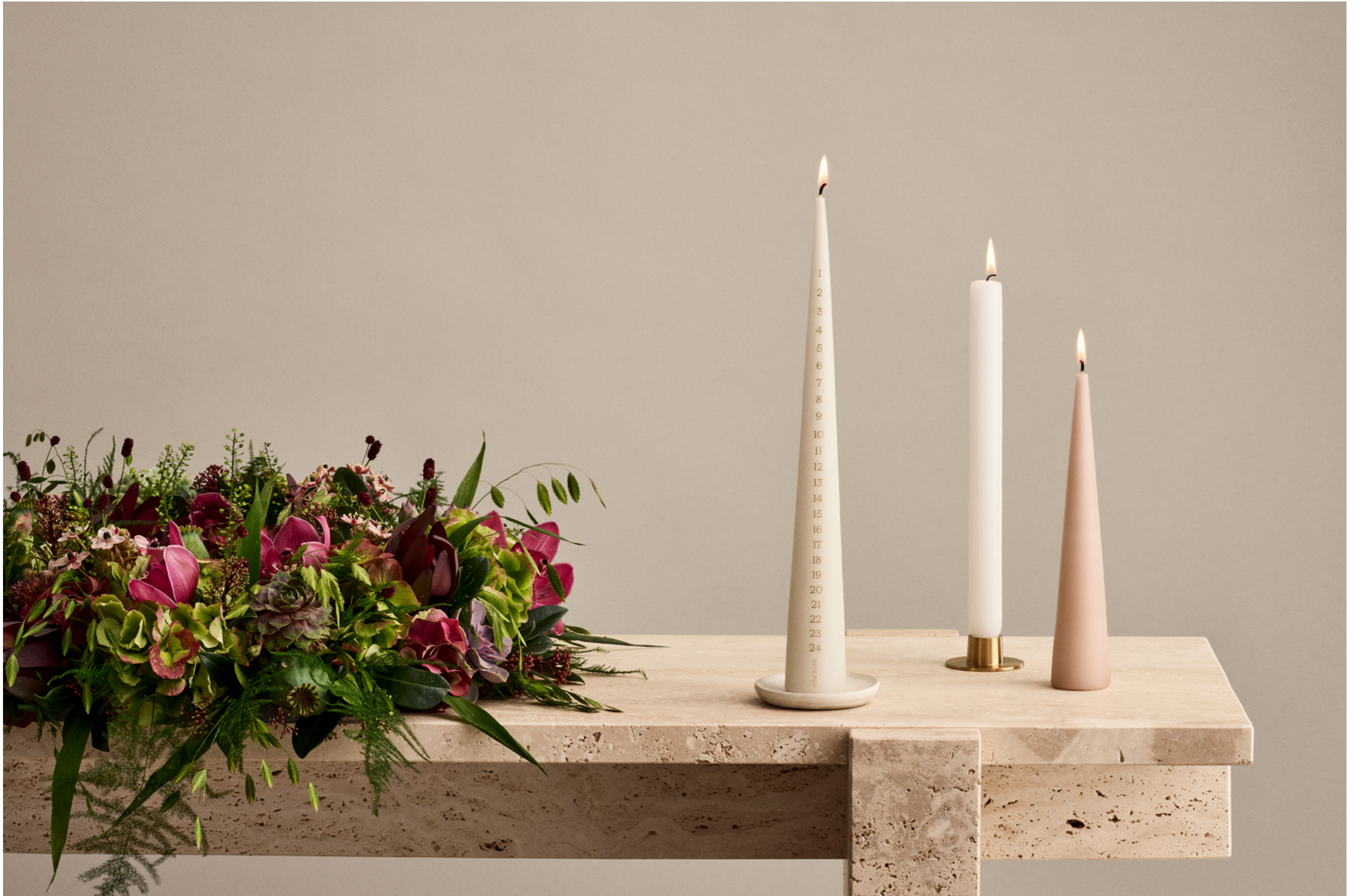
CANDLE COLOURS NO. 06, 31, 11