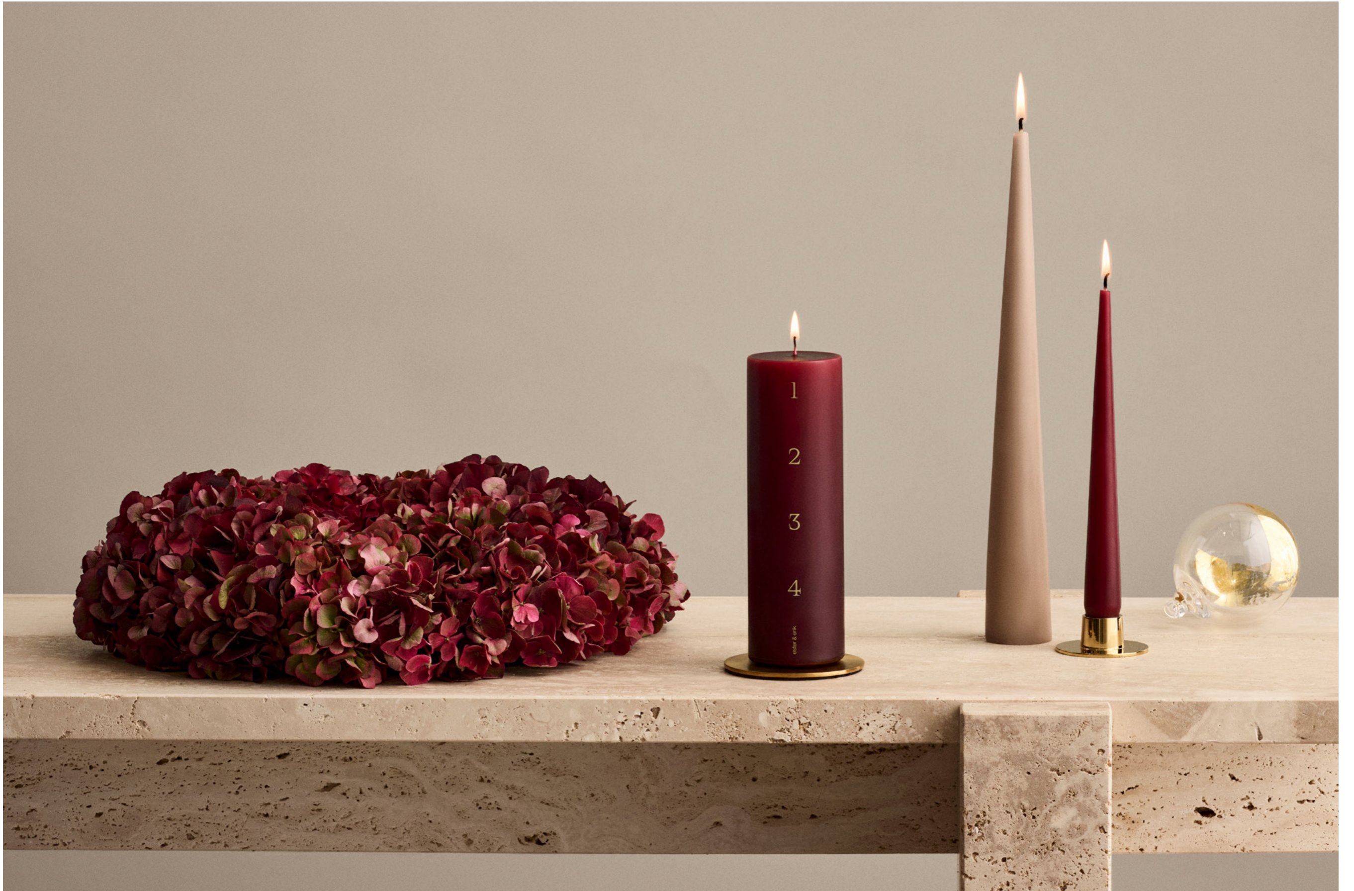
CANDLE COLOURS NO. 44/2, 18, 44/2