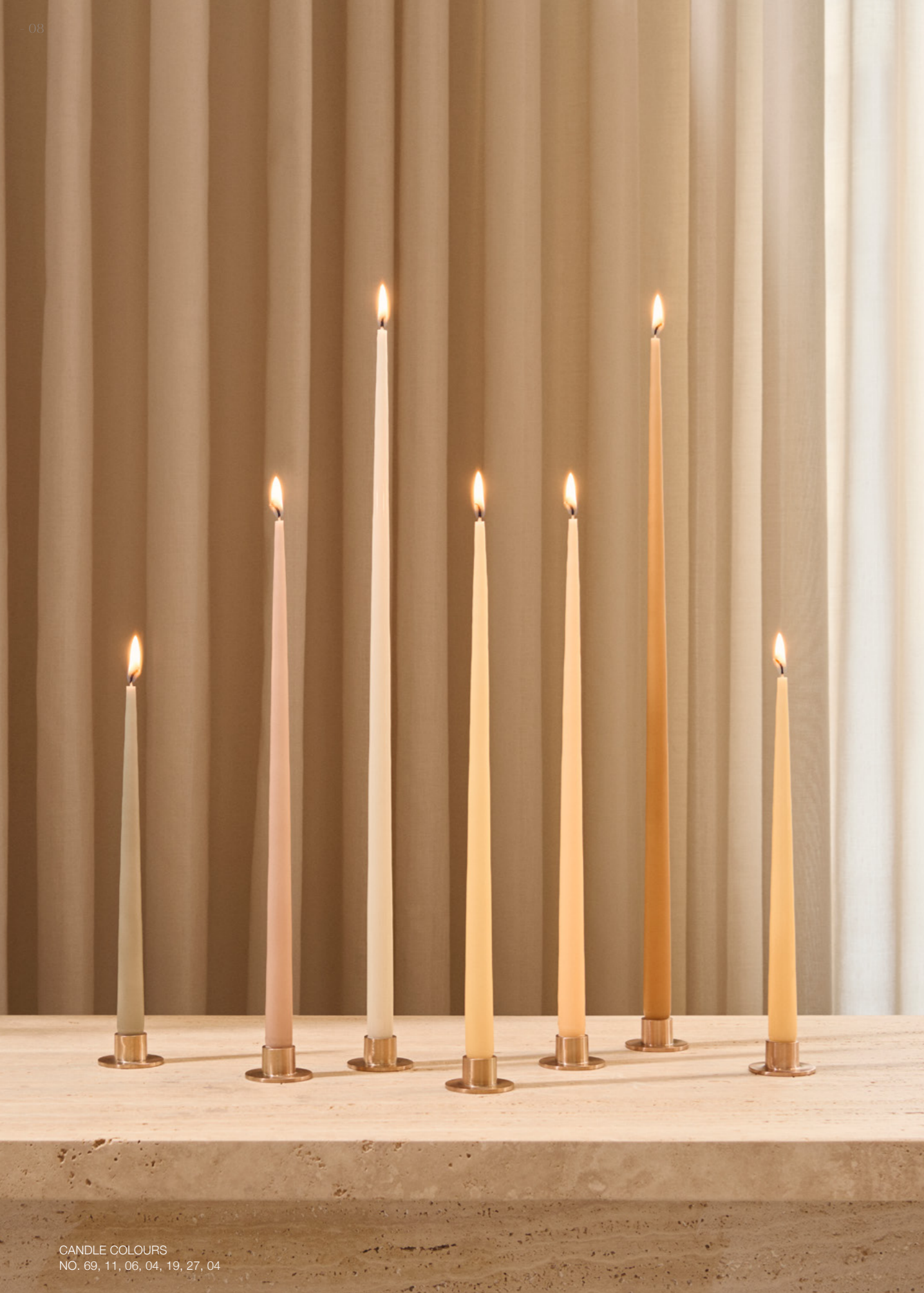
CANDLE COLOURS NO. 69, 11, 06, 04, 19, 27, 04