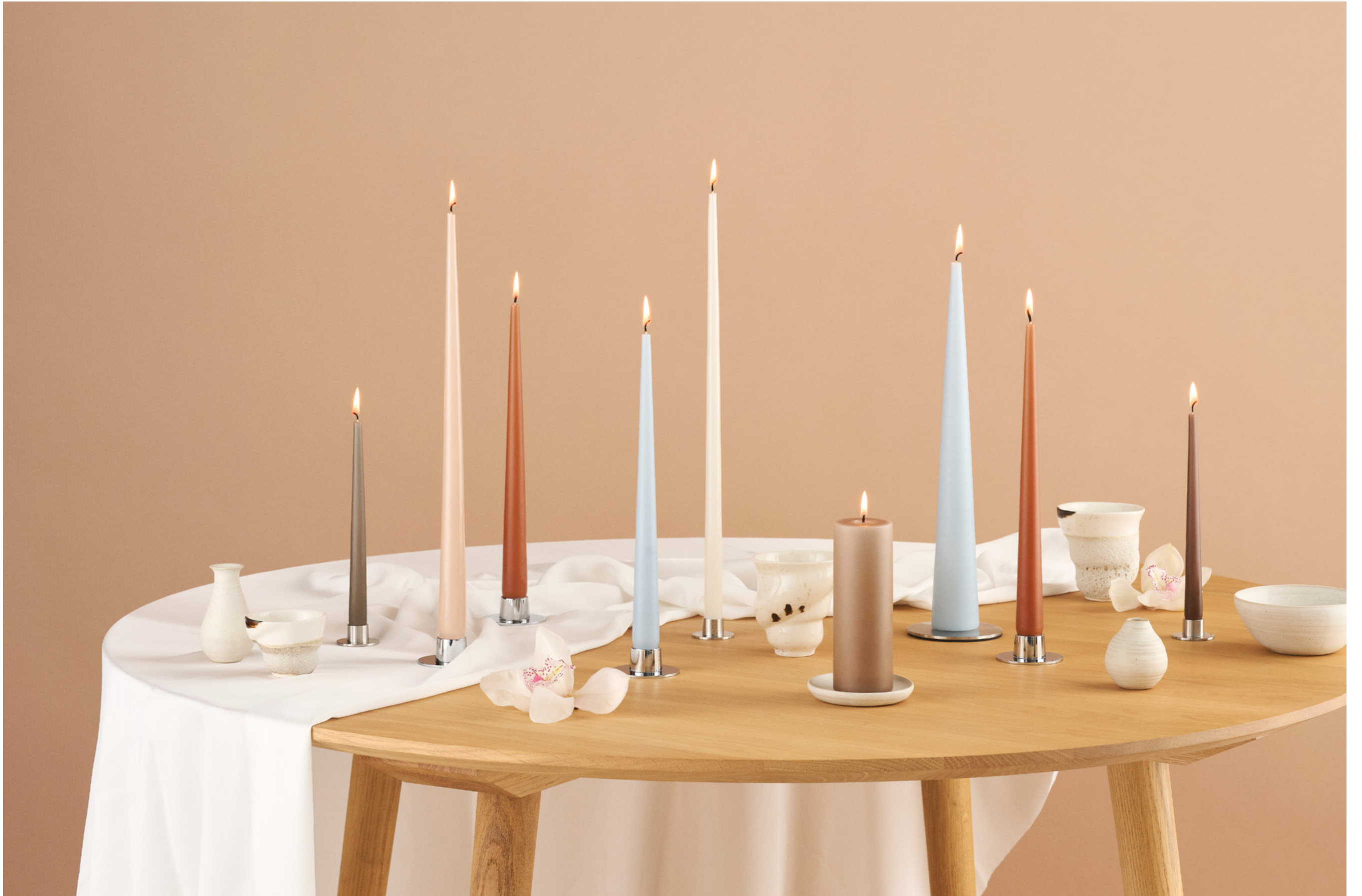
CANDLE COLOURS NO. 77, 11, 23, 83, 06, 18, 83, 23, 25