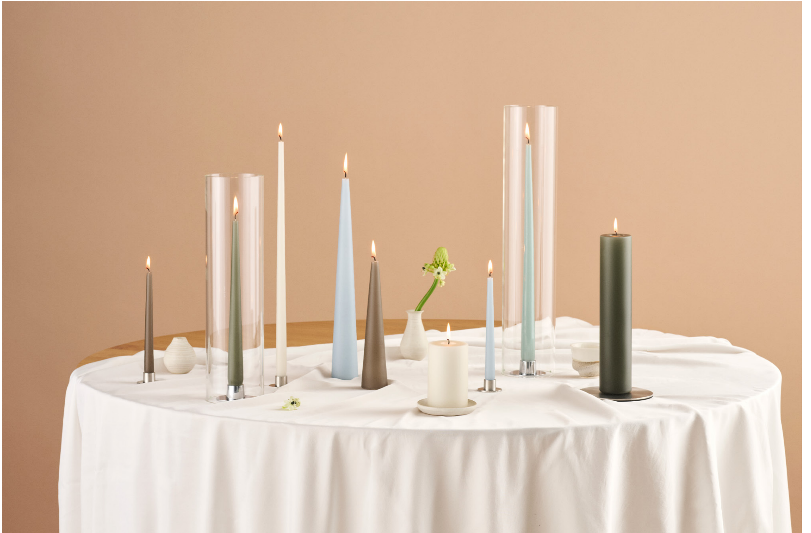
CANDLE COLOURS NO. 77, 70, 06, 83, 77, 06, 83, 67, 70