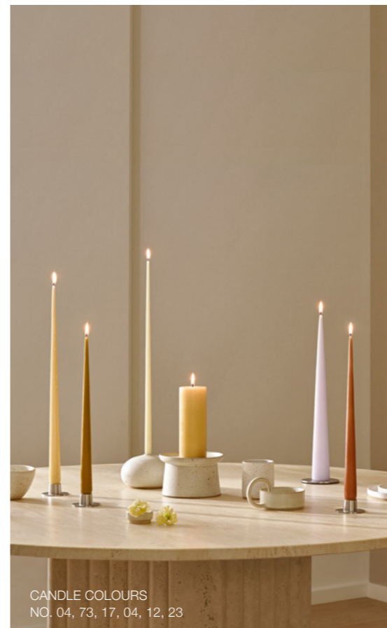
CANDLE COLOURS NO. 04, 73, 17, 04, 12, 23