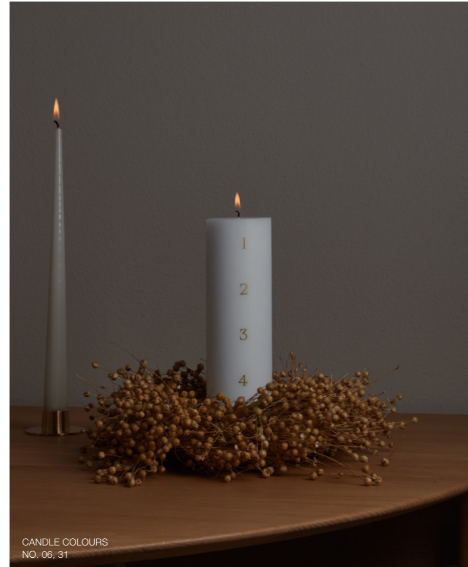
CANDLE COLOURS NO. 06, 31