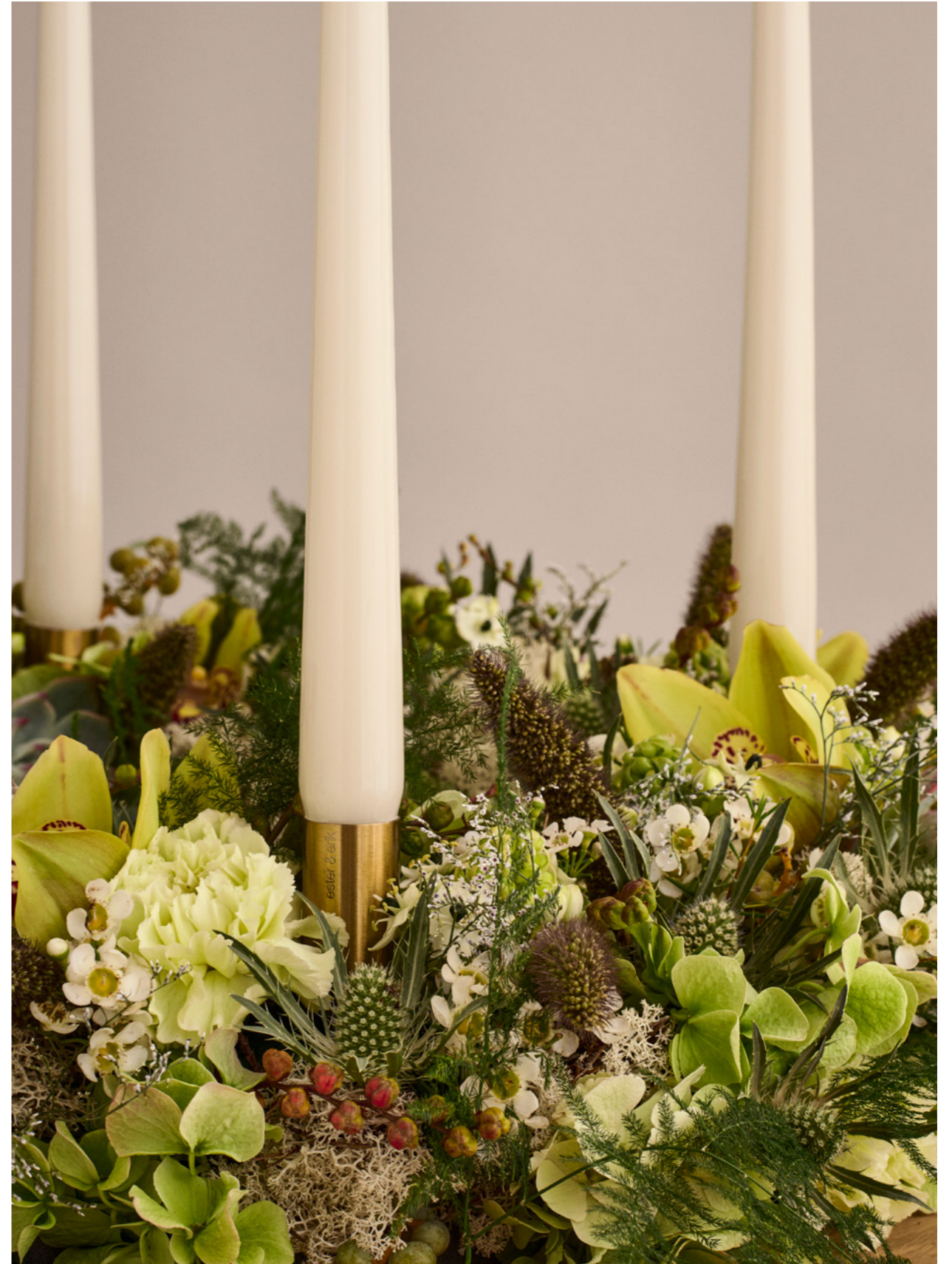
CANDLE COLOUR NO. 06