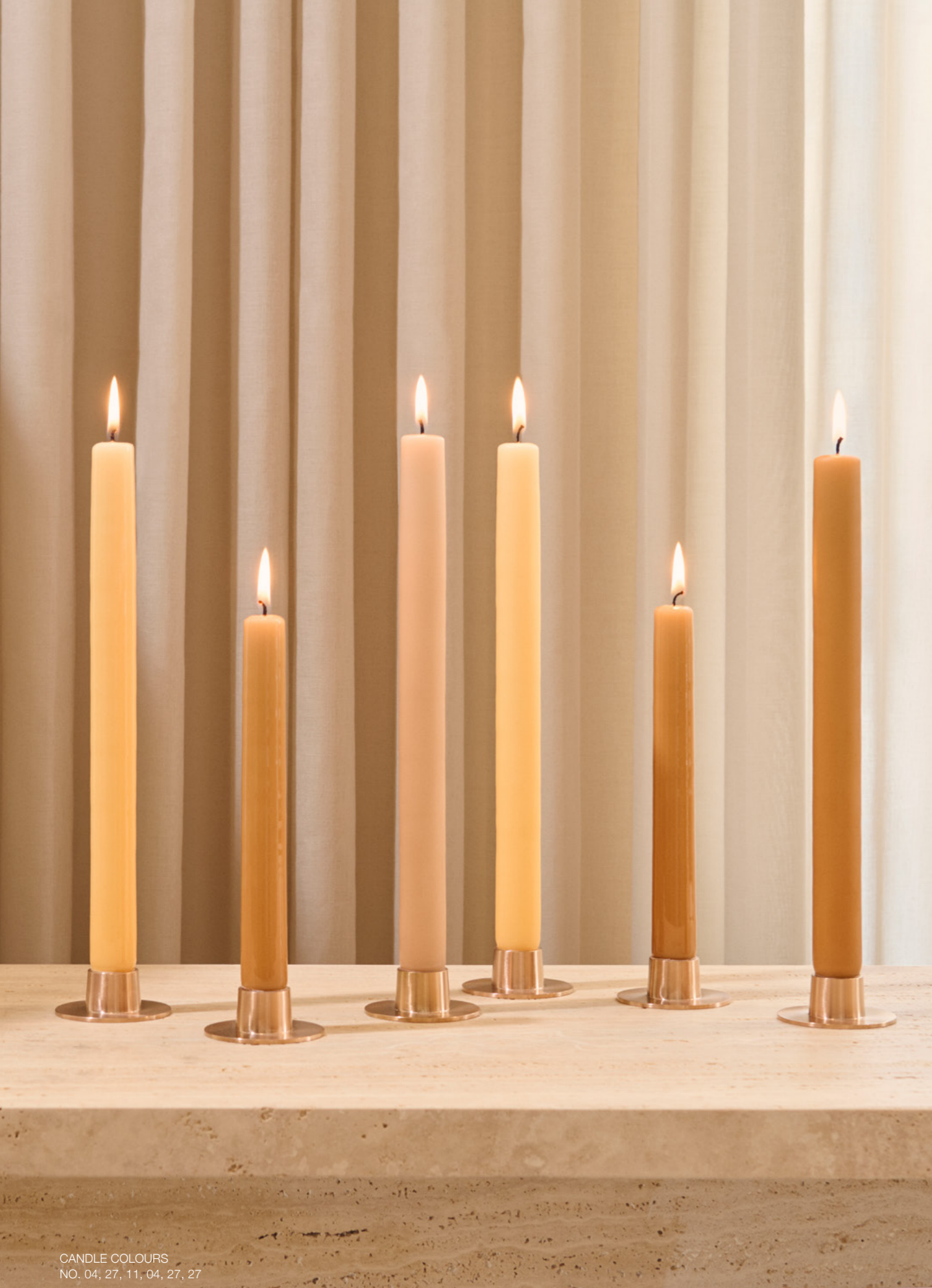
CANDLE COLOURS NO. 04, 27, 11, 04, 27, 27