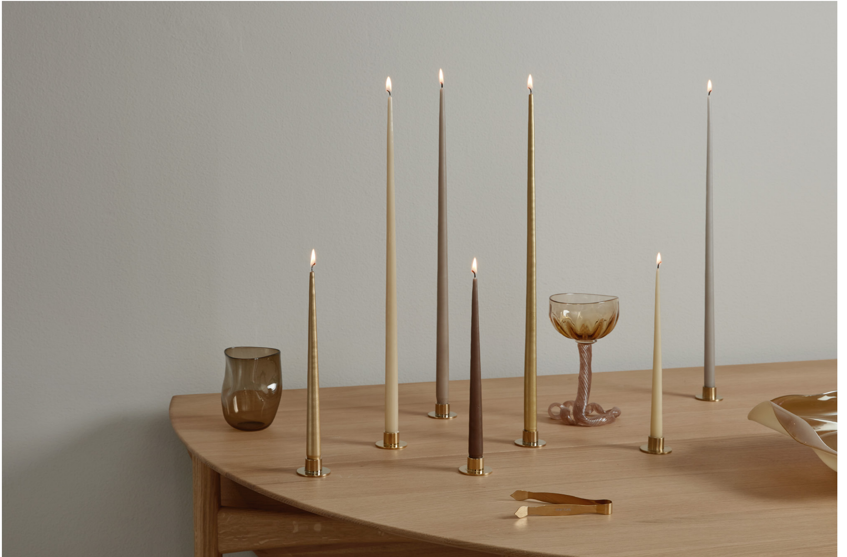
CANDLE COLOURS NO. 90, 14, 18, 25, 90, 14, 22