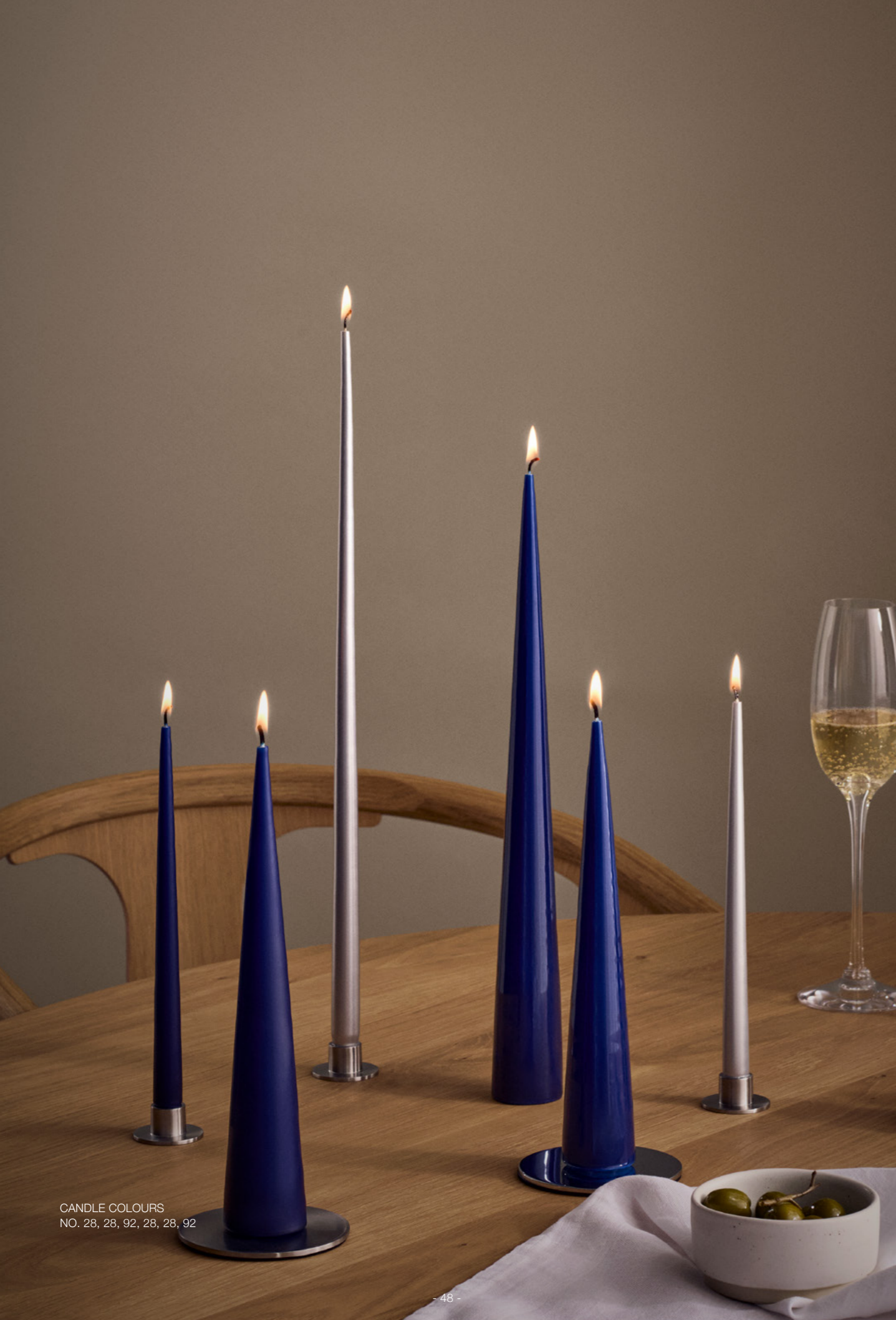
CANDLE COLOURS NO. 28, 28, 92, 28, 28, 92