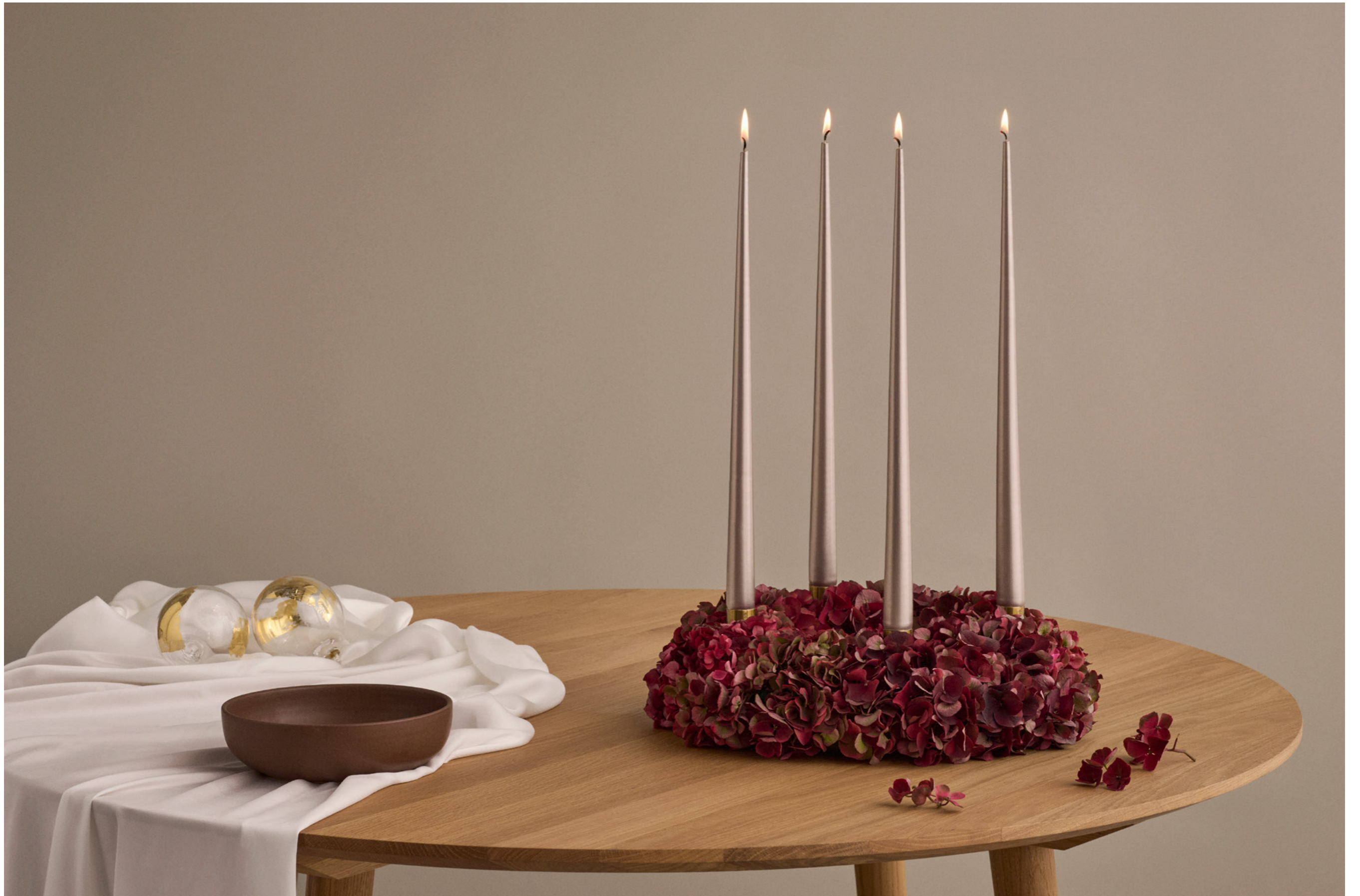
CANDLE COLOUR NO. 94