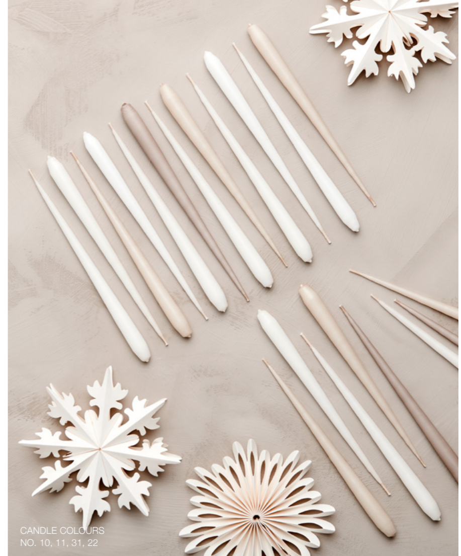
CANDLE COLOURS NO. 10, 11, 31, 22