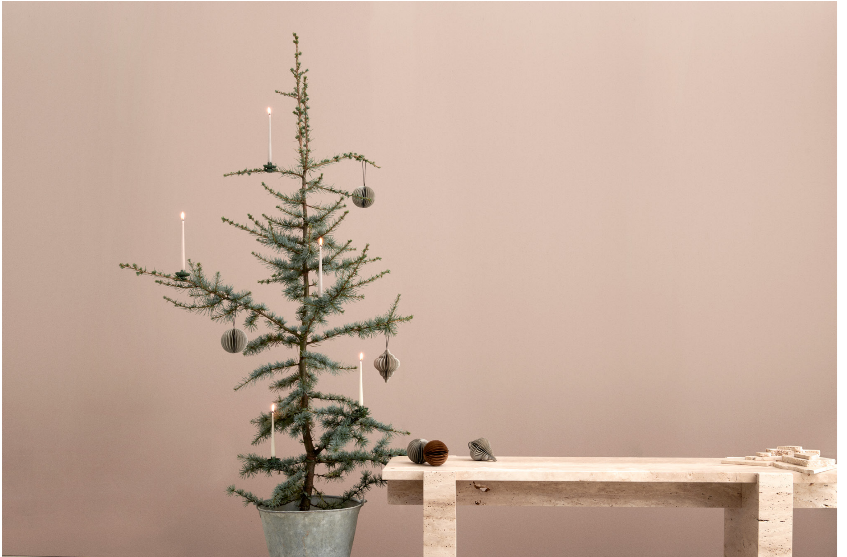
CANDLE COLOURS NO. 22, 11, 06