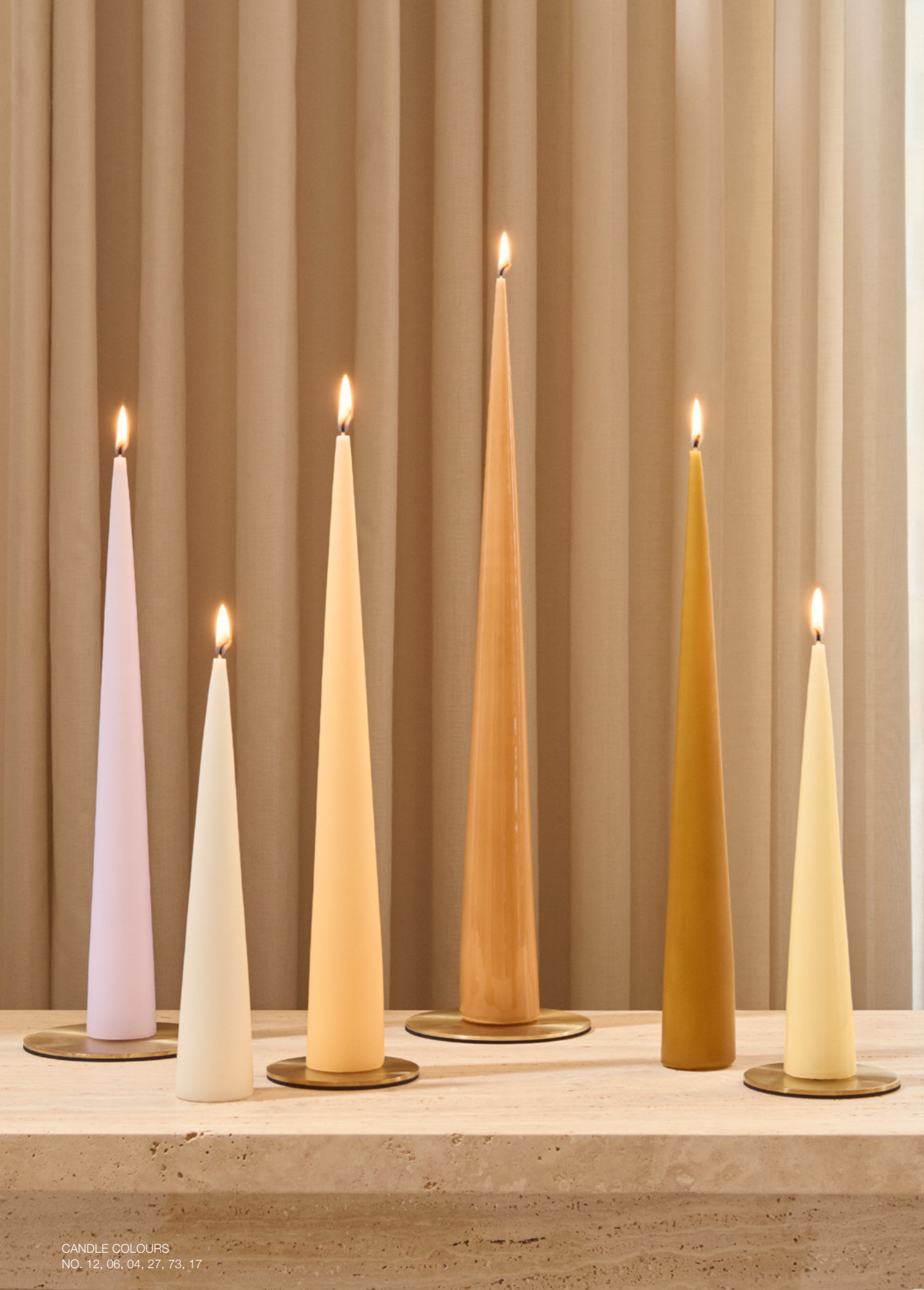
CANDLE COLOURS NO. 12, 06, 04, 27, 73, 17