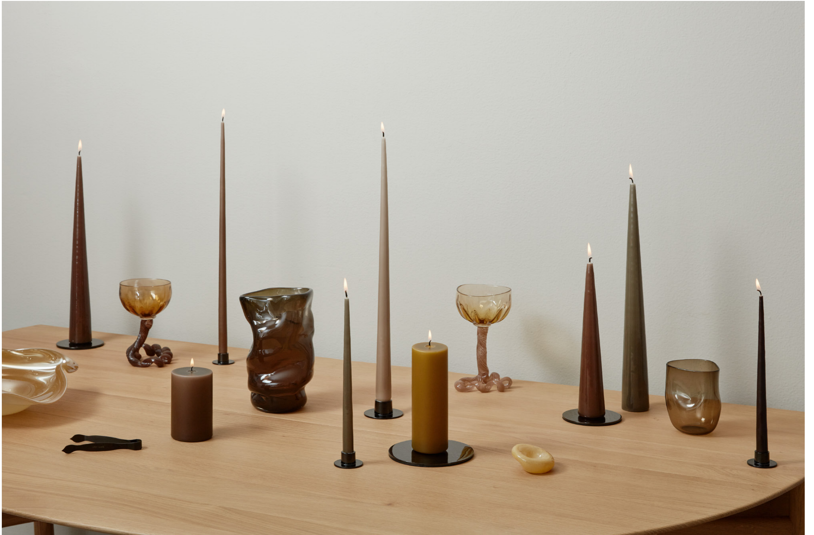
CANDLE COLOURS NO. 25, 25, 25, 77, 18, 73, 25, 77, 79