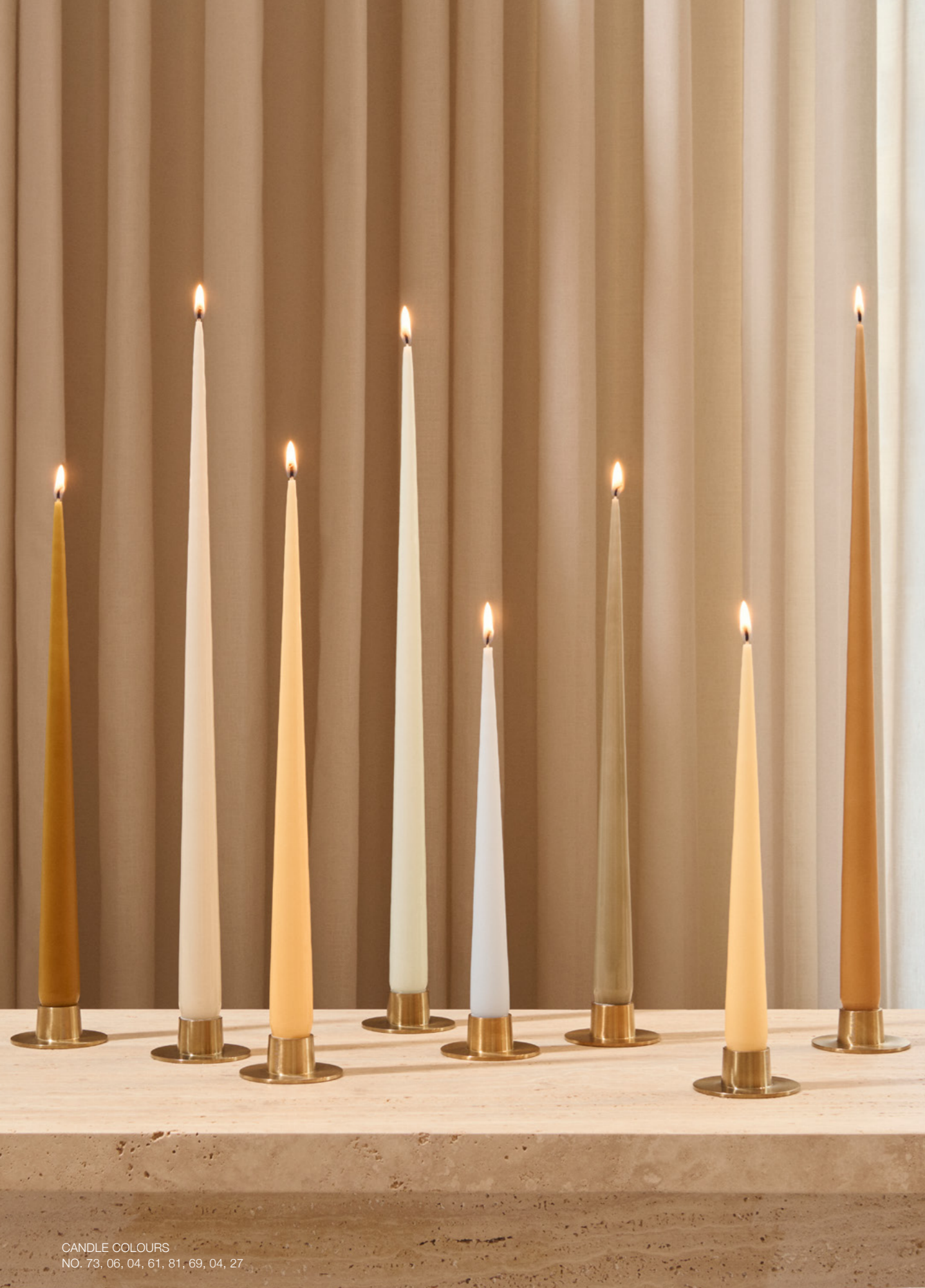
CANDLE COLOURS NO. 73, 06, 04, 61, 81, 69, 04, 27