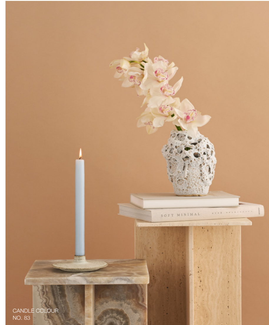
CANDLE COLOUR NO. 83