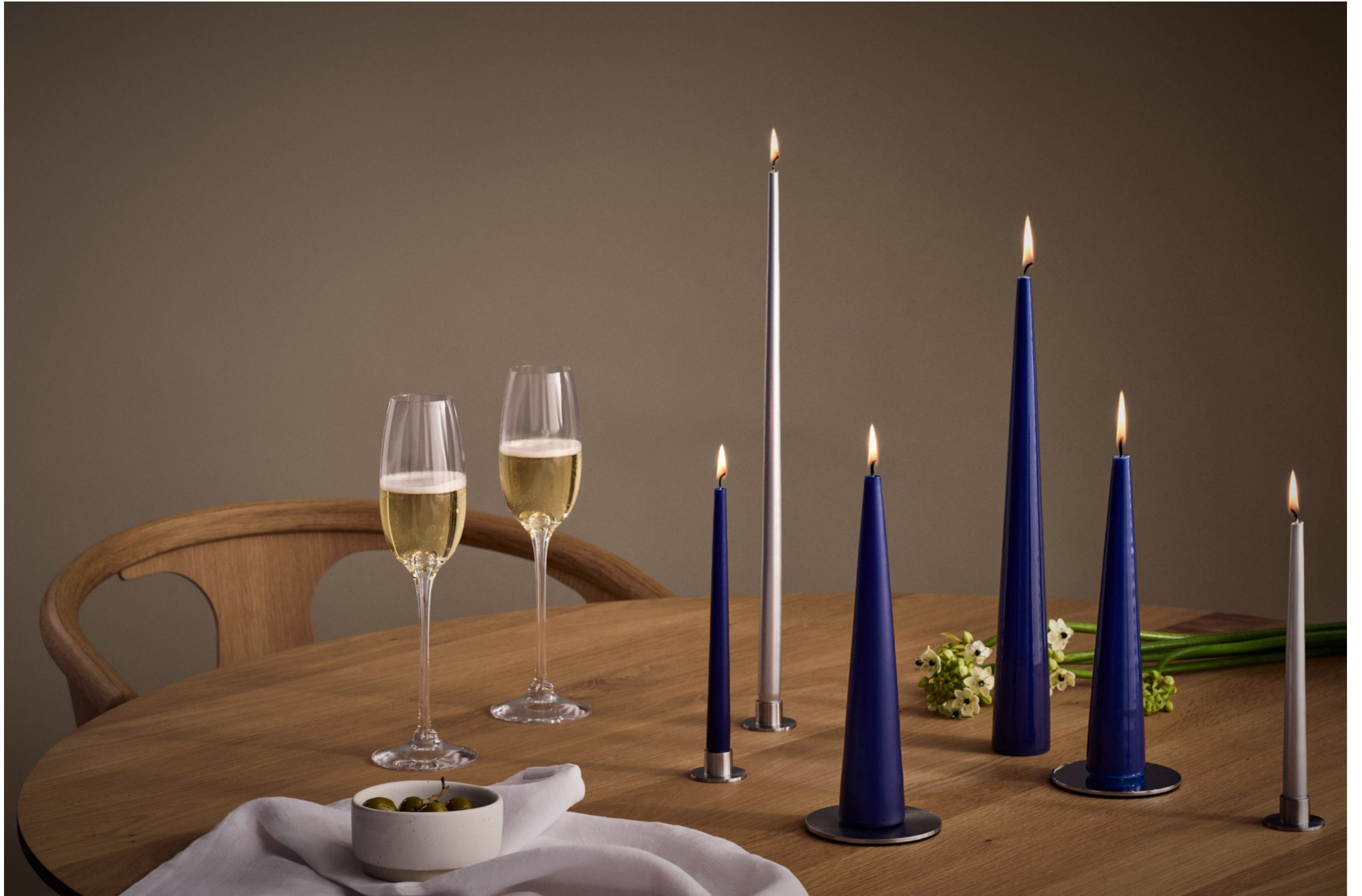
CANDLE COLOURS NO. 28, 92, 28, 28, 28, 92