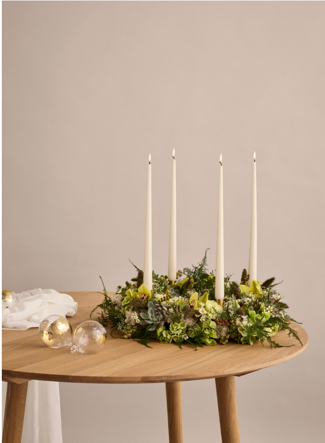
CANDLE COLOUR NO. 06