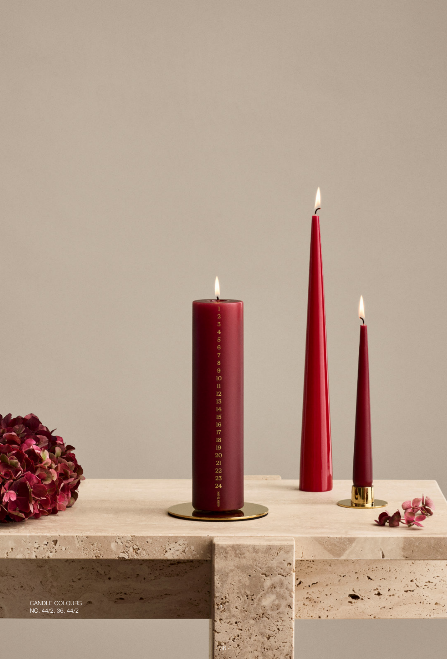
CANDLE COLOURS NO. 44/2, 36, 44/2