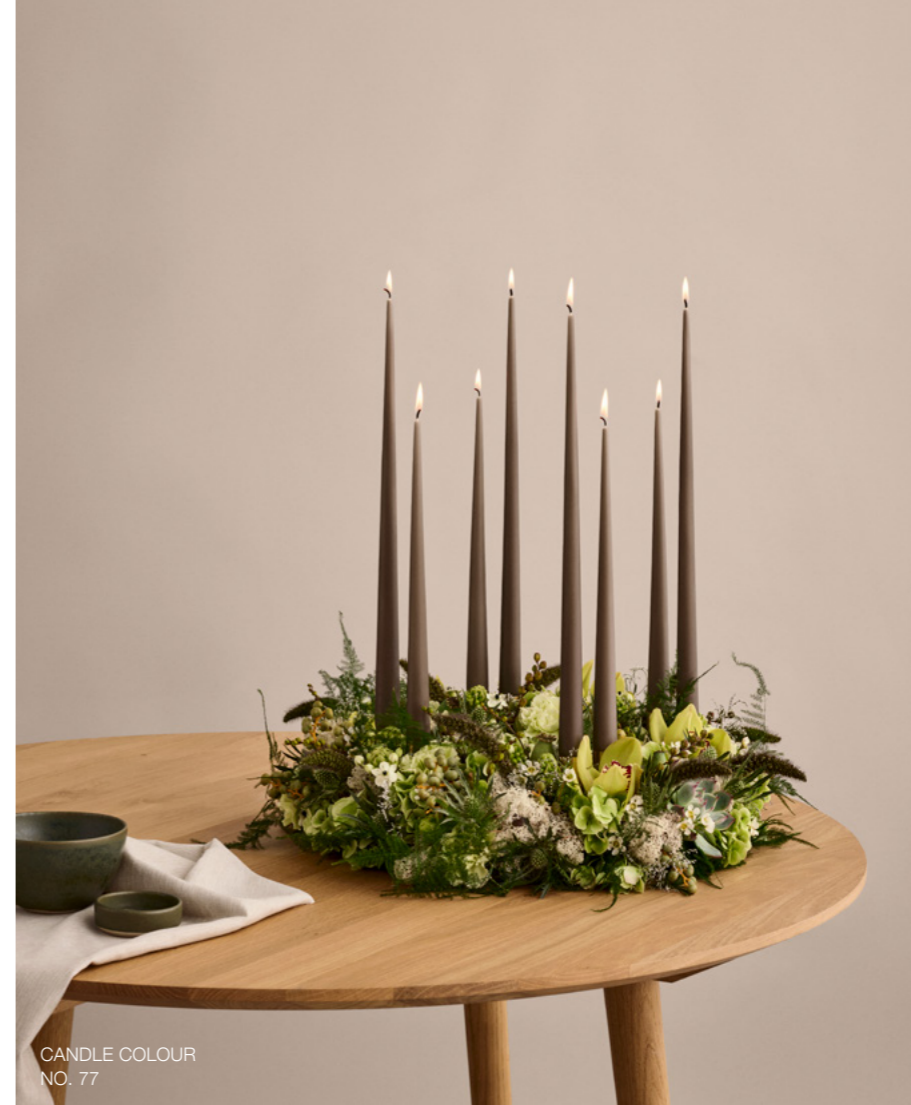
CANDLE COLOUR NO. 77