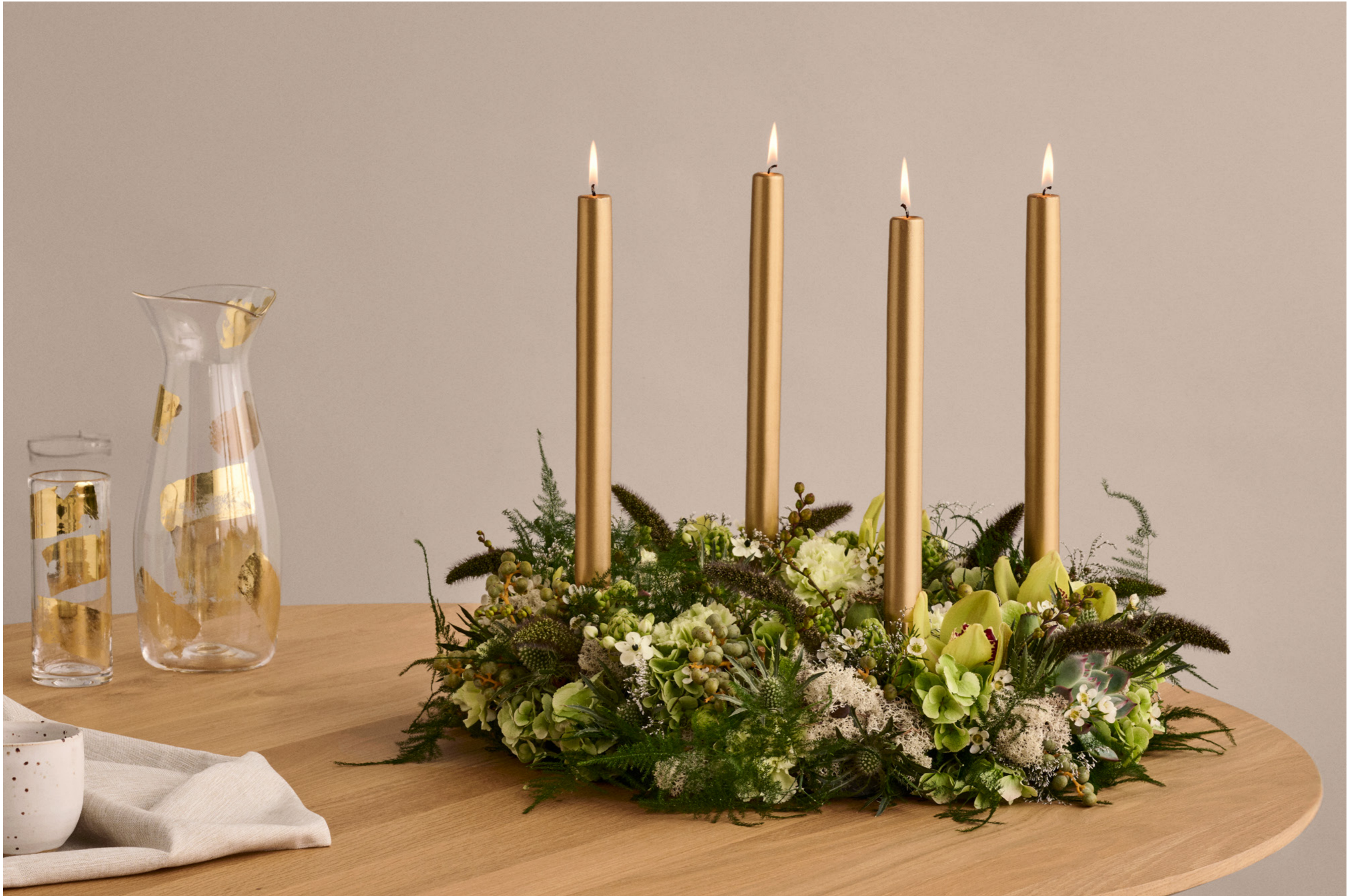
CANDLE COLOUR NO. 90