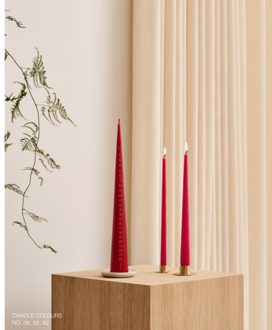
CANDLE COLOURS NO. 36, 82, 82