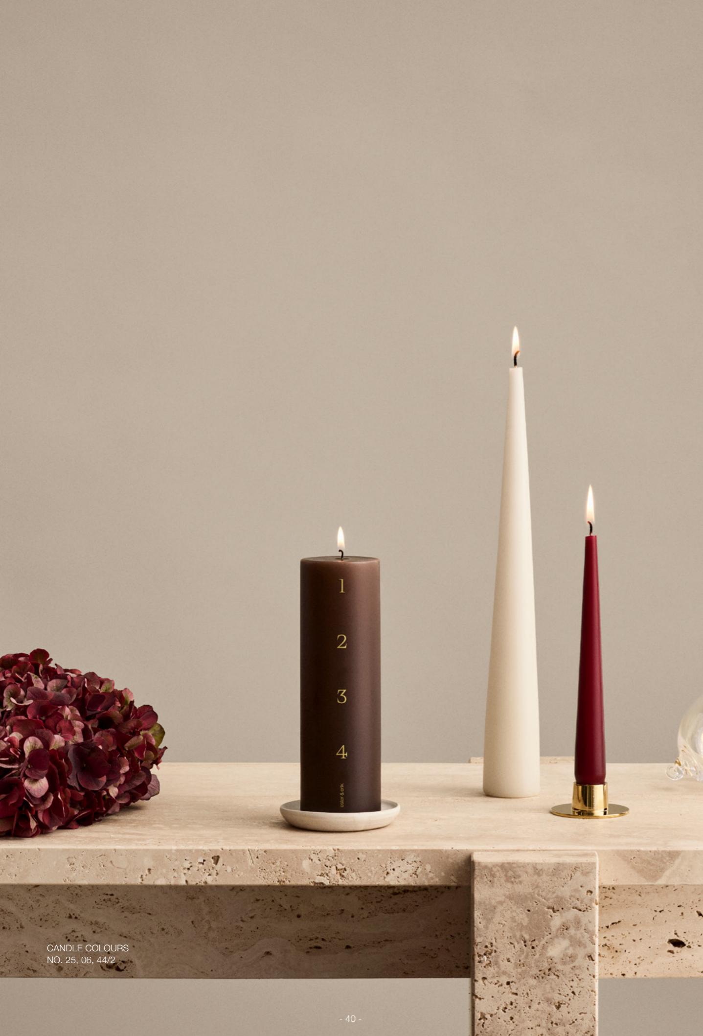
CANDLE COLOURS NO. 25, 06, 44/2