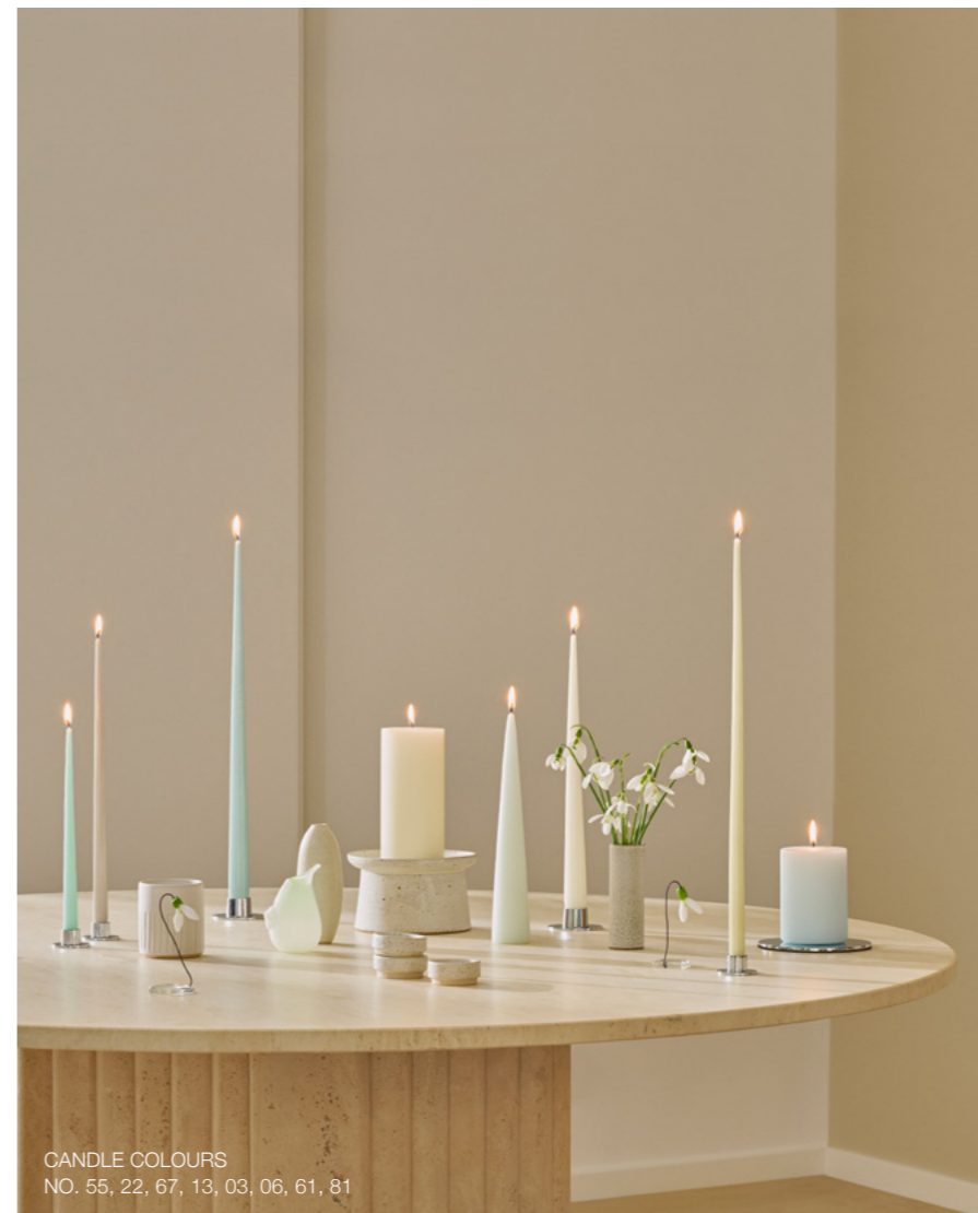
CANDLE COLOURS NO. 55, 22, 67, 13, 03, 06, 61, 81